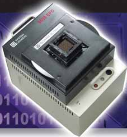
Extended Pin Driver Adapter