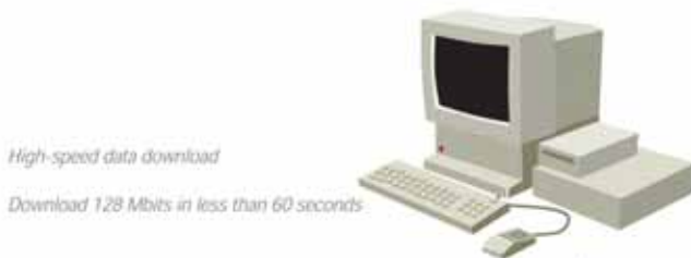
High-speed data download

To optimize programming throughput, the Model 9600 emphasizes maximum flexibility. A single system with multiple sites can easily be split into two or more separate systems.