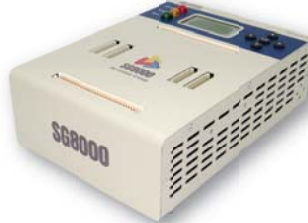
Main Frame Programmer

The programmer can be connected directly to a PC, or it can work stand alone without PC