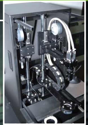
Downward CCD for top side inspecting