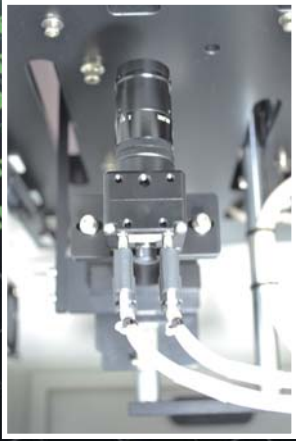
Upward CCD for bottom side inspecting